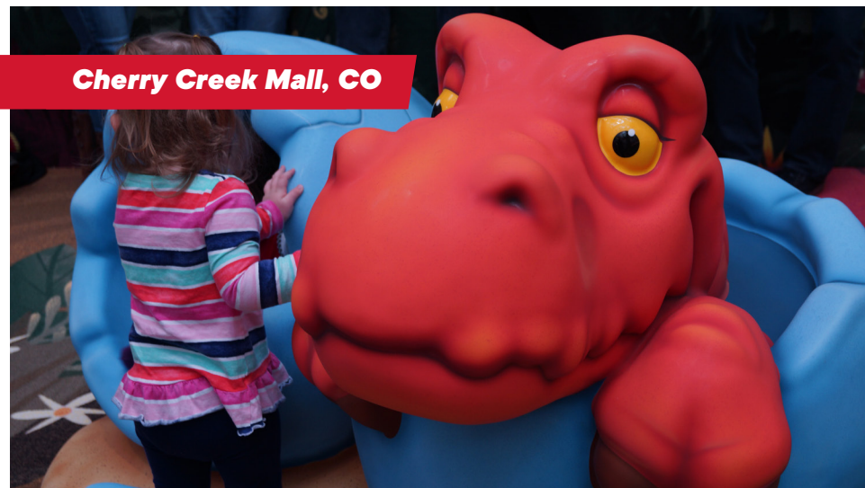
Cherry Creek Mall, CO