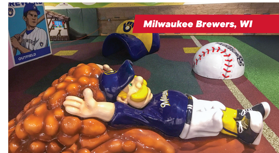
Milwaukee Brewers, WI