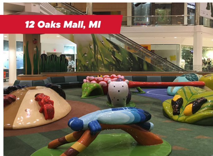
12 Oaks Mall, MI