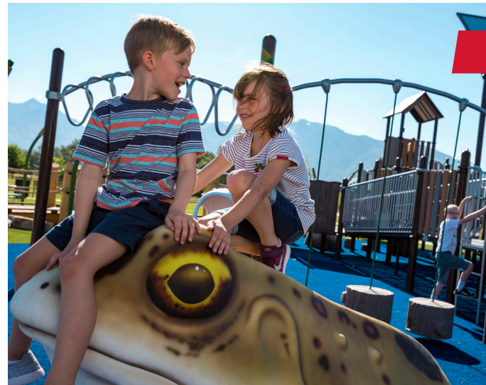
East River Front Park, UT