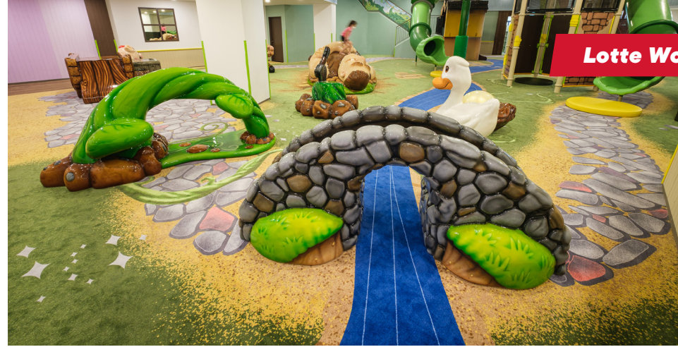
Lotte World, South Korea